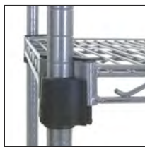
channel of shelf corner fits into slot of collar attached to split sleeve