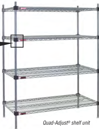
Quad-Adjust® shelf unit