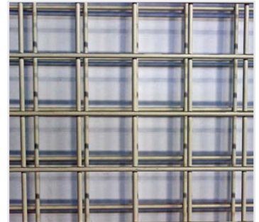
2” x 2” powder coat wire mesh allows flexibility in storage configurations.