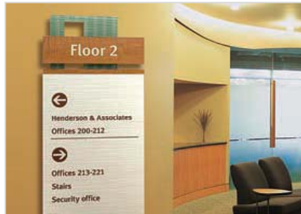
Signage & Wayfinding