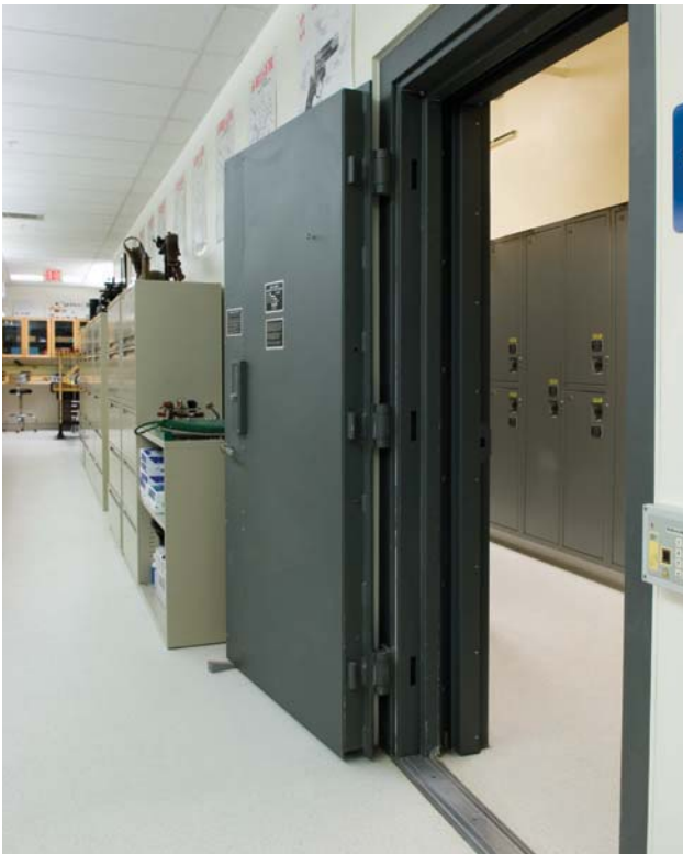
Firearms processed at the ballistics lab (above) are housed in a vault in customized DSM lockers, which provide the flexibility needed to store an array of weapons.

In the ballistics lab, a mechanical-assist HDMS system (left) stores virtually every kind of ammunition known. The unit features eight-inch-deep custom shelves, versus traditional shelf sizes, to conserve space.