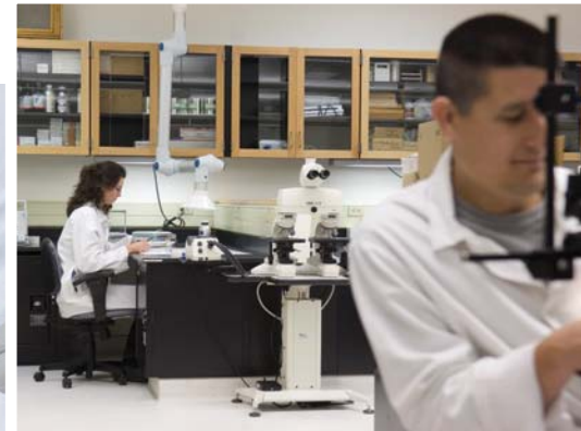
(Left) After evidence is logged, lab scientists conduct a variety of tests and analyses. Here, a forensic scientist places evidence inside a DSM evidence locker. The unit automatically shuts, and when locked, can only be accessed by the person in charge of the tests.

When not at their station, the scientists place evidence in non-pass-through DSM customized to fit under the scientists' desks for extra security and space savings.