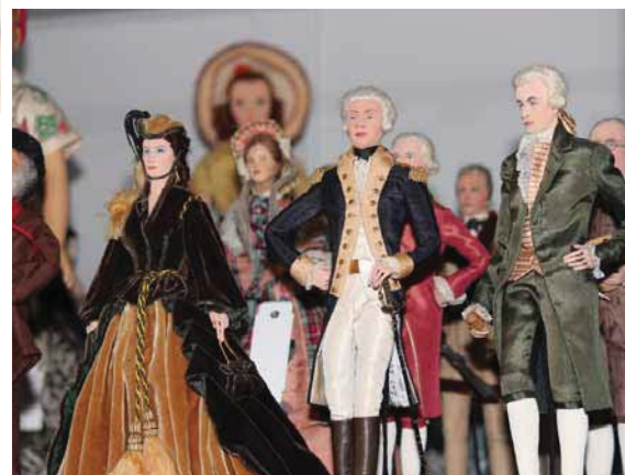
(Right) Historical dolls find a place to be displayed in the new system.

Today, some of the unique collections being stored on these systems include 1,500 classic Barbies, 450 vintage toy airplanes, 1,600 yo-yos, quilt collections dating back to the mid-1800s, and much more.