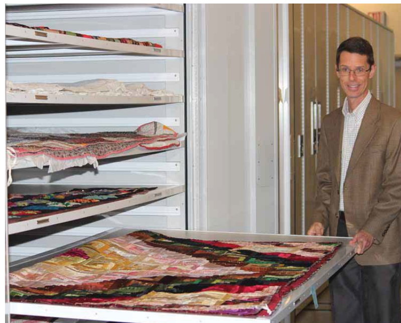
Fragile antique quilts are well-preserved in pull out drawers mounted on a mobile system.

The storage systems put in place in the National Museum of Play were designed to allow for significant collection growth. Shelving units are highly customizable depending on the size and weight of the items that get added to the collection.