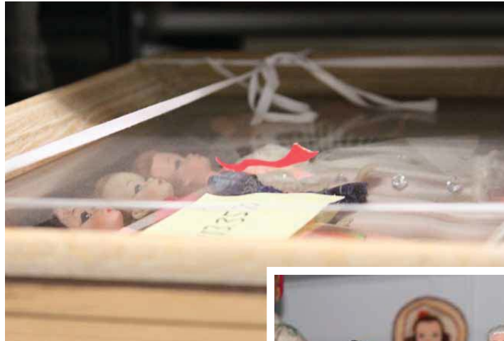
(Above) Vintage Barbies are safely stored under glass on shelves.

Today, some of the unique collections being stored on these systems include 1,500 classic Barbies, 450 vintage toy airplanes, 1,600 yo-yos, quilt collections dating back to the mid-1800s, and much more.