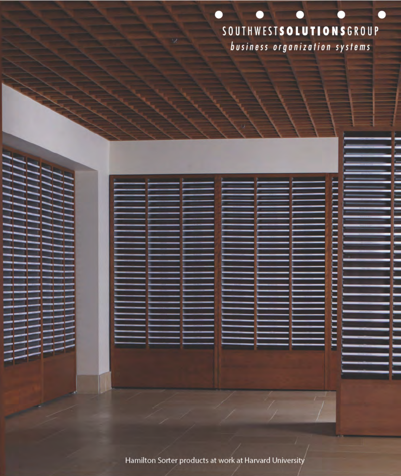
Hamilton Sorter products at work at Harvard University