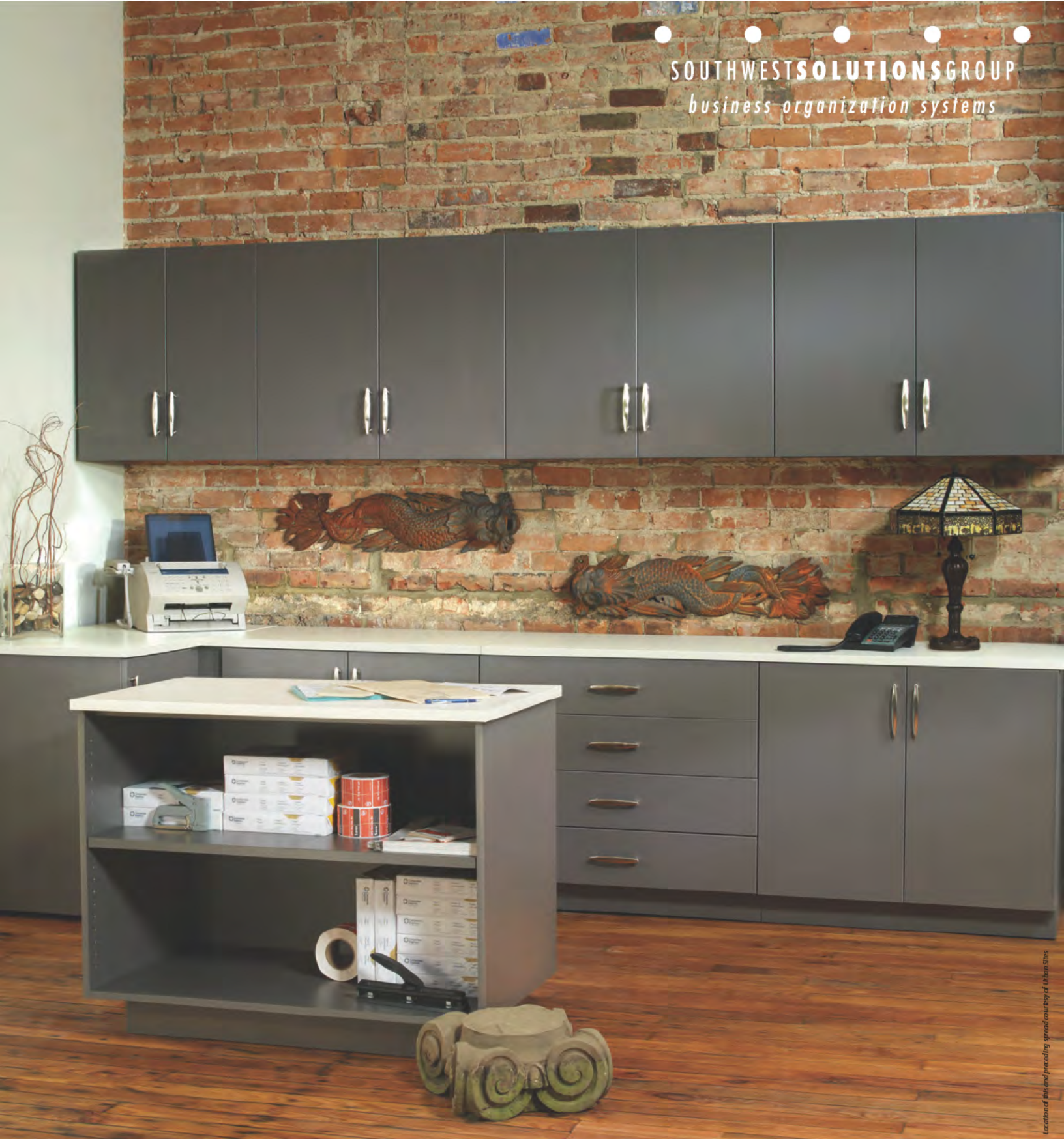
Location of this and preceding spreads courtesy of Urban Sites