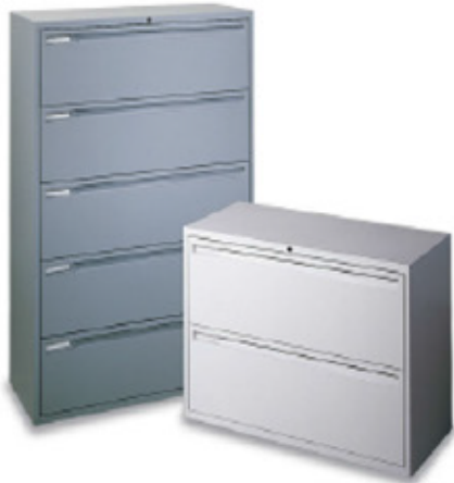
Lateral File Cabinets