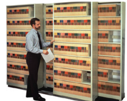
Lateral Sliding Shelves