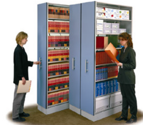
Pullout Storage Unit