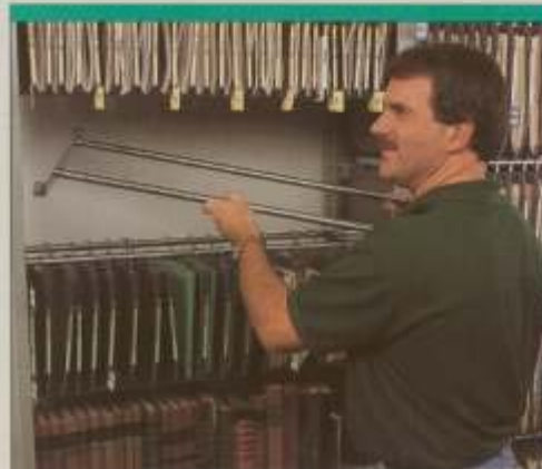
Oblique Rail Assemblies are simple, economic and versatile and adapt to Cantilever, Case-Style, Four Post and any other shelving type.