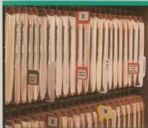
Out Guides, Current Guides, Sidestops and Backstops make your Oblique System even more effective and efficient.